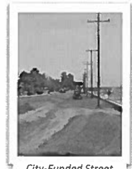
City-Funded Street Development

F12. At the time of this report, $20-$30 million in City-funded construction projects were in progress, with many more planned.