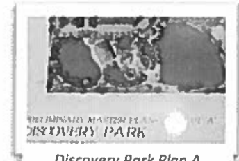
Discovery Park Plan A

F8. The City has an 1800 acre “General Plan Amendment” that includes redoing sidewalks, curbs, and gutters on East Sherwood Avenue and also includes zoning for residential, industrial, and commercial construction. A twelve-acre park is planned on East Sherwood Avenue.