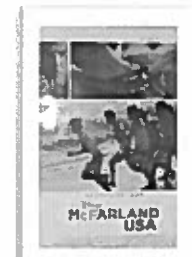
McFarland USA Movie Poster

Neither the movie version nor the news version is complete or even wholly accurate. Just a few months after the release of McFarland USA , the 2014-2015 Kern County Grand Jury (Grand Jury) set out to discover the true nature of the City of McFarland (City).